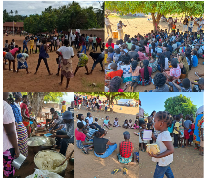
Assisting children and families displaced by floods living in temporary camps in Xai-Xai.

The children still gathered, still laughed, still learned, and still spent time in God's Word. What could have been weeks of instability instead became a place of routine, care, and reassurance. In the middle of everything happening around them, the program remained a constant—reminding each child that they are seen, valued, and not alone.